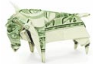
Money and Success

main promises of happiness in our society and culture. The following horoscope analysis presents your very personal dispositions and resources that make it possible for you to develop your individual potential. Knowing what type of wealth and happiness is allotted to you and which investments pay off gives you the chance to take action according to your own standards and not let yourself be guided by other people's values. 34-45 pages. Specify gender, birth date, time and place.