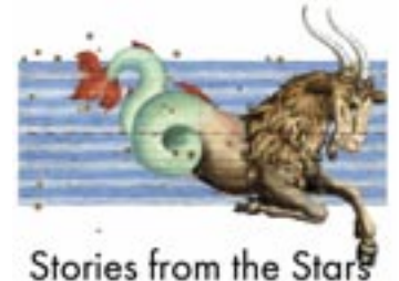
Stories from the Stars

The vault of the heavens is an awe-inspiring lace-work of stars. The starry sky, however, is more than just beautiful, it also carries wisdom contained within stories. Over thousands of years our ancestors slowly inked their risings and appearances to human spiritual beliefs and earthly struggles and joys. Stories from the Stars gives you information that allows you to understand these fixed stars in this life, your actions, choices and attitudes. Connect with the living cosmos and gain a deeper understanding of your life. 25-32 pages. Specify gender, birth date, time and place. 25-32 pages. Please specify gender, birth date, time and place.